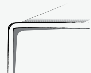
trim stitching cucitura con filetto

base in black MDF wood base in legno MDF nero