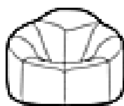
SWIVELLING ARMCHAIR HIGH BACK

Height 830 mm Width 1,050 mm Depth 830 mm Seat height 370 mm Weight 17 kg Seats 1 place