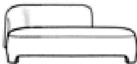
MEDIUM 1-ARMED SETTEE (LEFT) COMPLETE ITEM