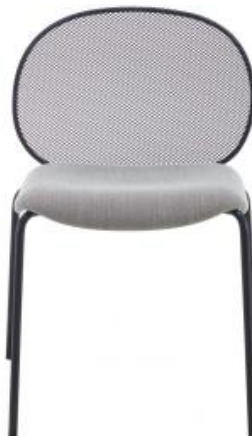
CHAIR INDOOR WHITE LACQUERED BASE